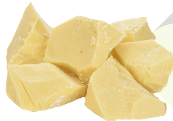
Solid fats or semi solid fat paste