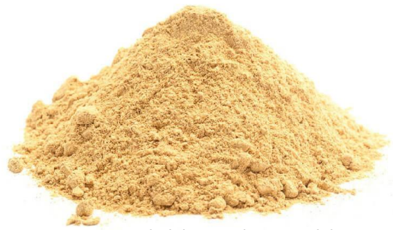
Water soluble or dispersible powders

Our products are available in various forms, concentrations and qualities. Please ask us for your exact requirements or see our product list.